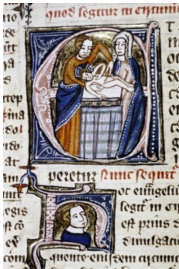
A mohel performing circumcision

Circumcision (cutting away the male foreskin) was not entirely new in this period of history, but the special religious and theocratic significance then applied to it was entirely new, thus identifying the circumcised as belonging to the physical and ethnical lineage of Abraham (cf. Acts 7:8; Ro 4:11). Without divine revelation, the rite would not have had this distinctive significance, thus it remained a theocratic distinctive of Israel (cf. v13). There was a health benefit , since disease could be kept in the folds of the foreskin, so that removing it prevented that. Historically, Jewish women have had the lowest rate of cervical cancer. But the symbolism had to do with the need to cut away sin and be cleansed. It was the male organ which most clearly demonstrated the depth of depravity because it carried the seed that produced depraved sinners....This cleansing of the physical organ so as not to pass on disease... was a picture of the deep need for cleansing from depravity, which is most clearly revealed by procreation, as men produce sinners and only sinners. Circumcision points to the fact that cleansing is needed at the very core of a human being, a cleansing God offers to the faithful and penitent through the sacrifice of Christ to come. (Borrow The MacArthur Study Bible ) (Bolding added)